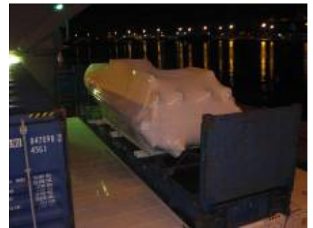
Rib being loaded onto Flat Rack