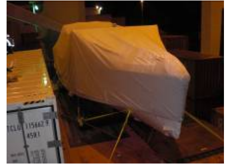
Tender on Flat Rack on vessel