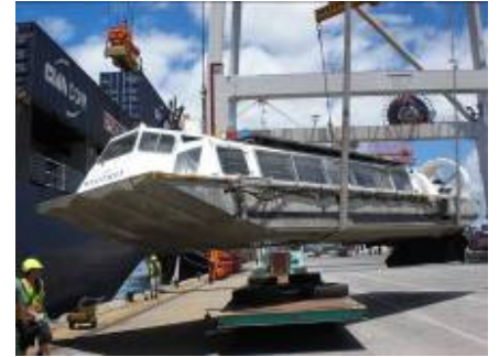
52ft Searay arrives in Auckland